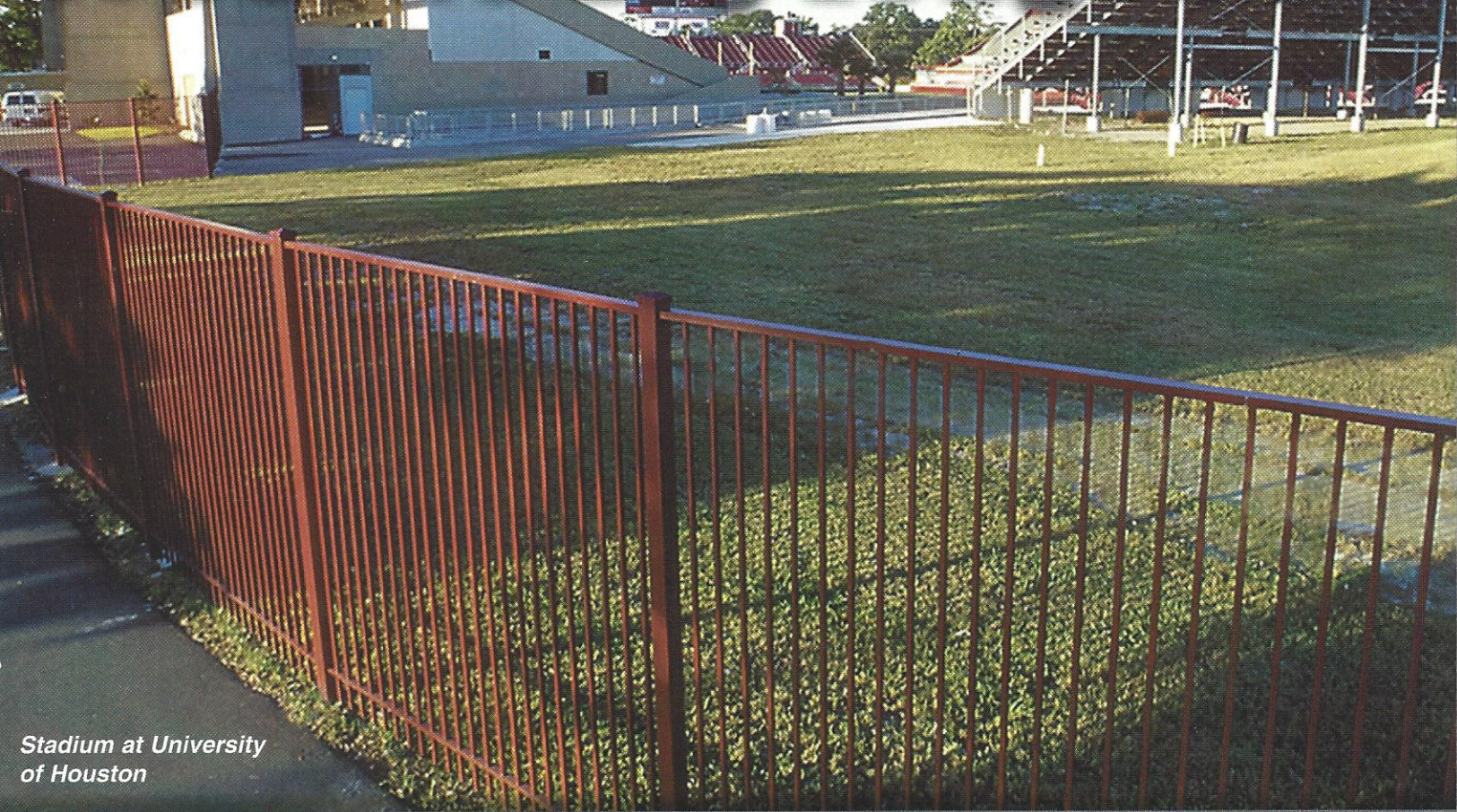
Stadium at University of Houston