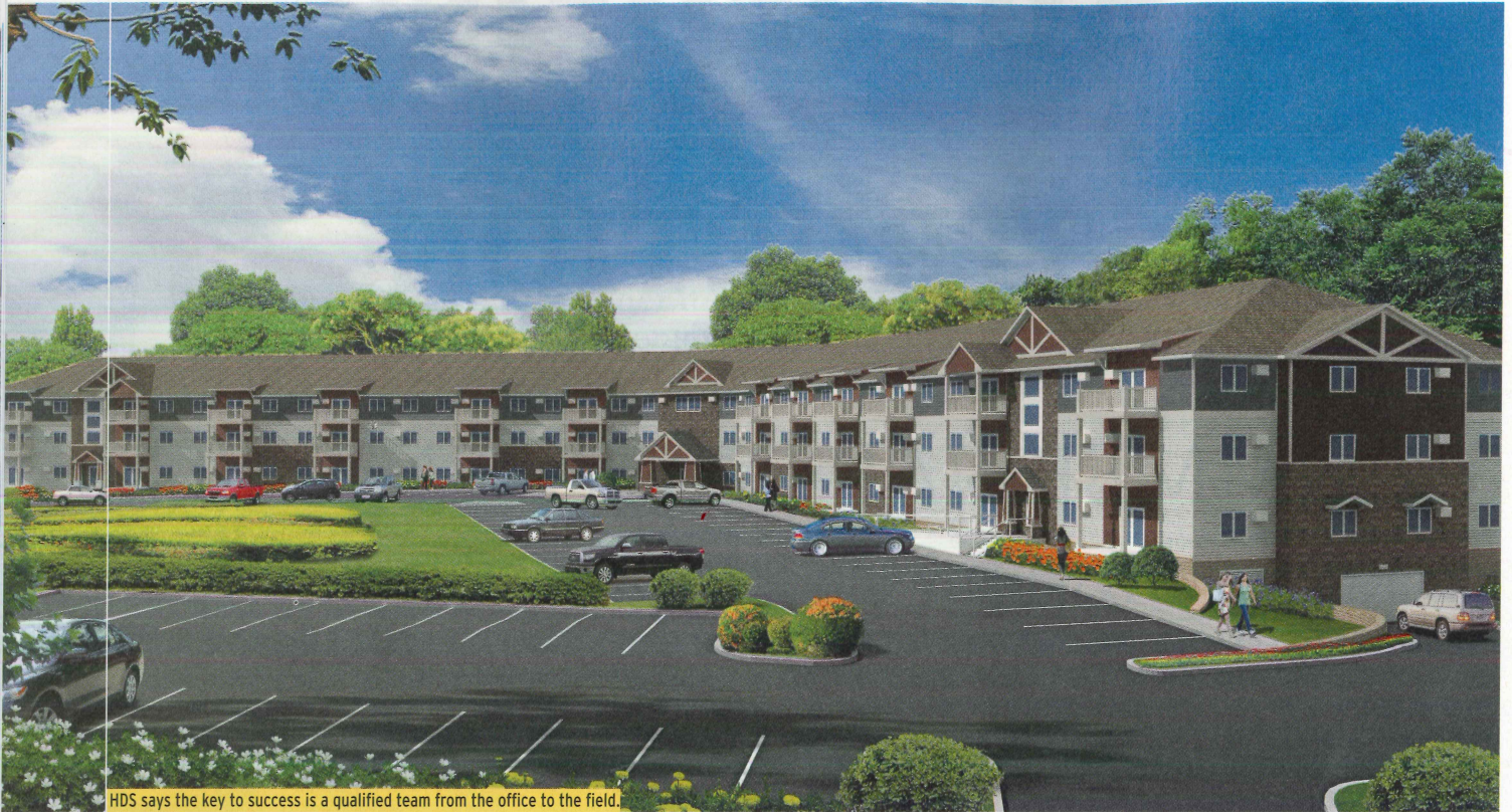
HDC says the key to success is a qualified team from the office to the field.