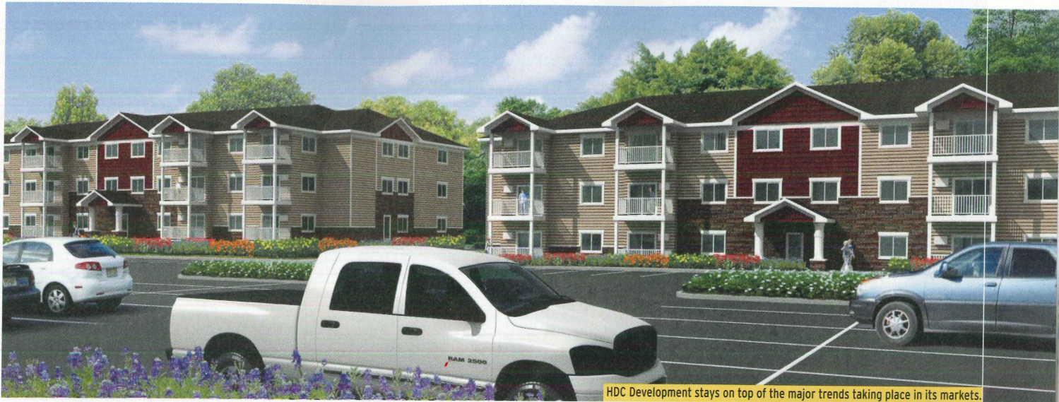
HDC Development stays on top of the major trends taking place in its markets.