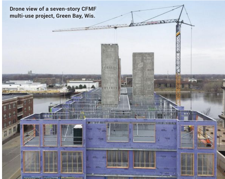
Drone view of a seven-story CFMF multi-use project, Green Bay, Wis.

climate-controlled facility and installed on site with an efficient and economical crew. As Ryan explains, "The idea is to embrace the whole lean construction technique that general contractors are always talking about. We're providing those initial design services up front, in hopes of getting brought to the table sooner so we can incorporate value-added solutions while driving down project cost and reducing the overall project schedule."