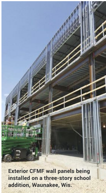
Exterior CFMF wall panels being installed on a three-story school addition, Waunakee, Wis.

In today's construction industry, we battle an unfortunate labor shortage day in and day out. One of Ryan and Kurt's business goals with Wall-Panel/UBS is to not only provide engineered wall panels and components for projects but also to look at expanding the amount of work that can be prefabricated in a