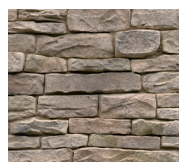
Shade Mountain 8054