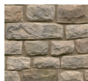
Shade Mountain 8054