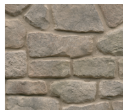
Shade Mountain 8054