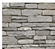
PA Lime 8046