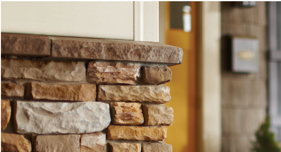
Tapered Sill in Brown