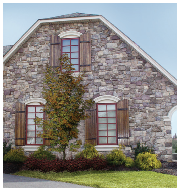
Fieldstone in Autumn

Ply Gem Stone is available in a wide variety of styles. Some lend a rustic character to your home or evoke an old-world aesthetic, while others look distinctly contemporary. Each has a timeless quality and a natural beauty that can define and enhance your home's character. More affordable than quarried stone or fieldstone, it's an investment that rewards you with a distinctive natural charm.