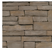
Sandy Creek 8082