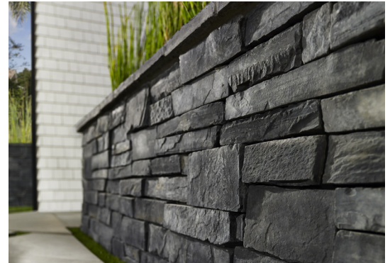
Cascade Ledge in Mystic