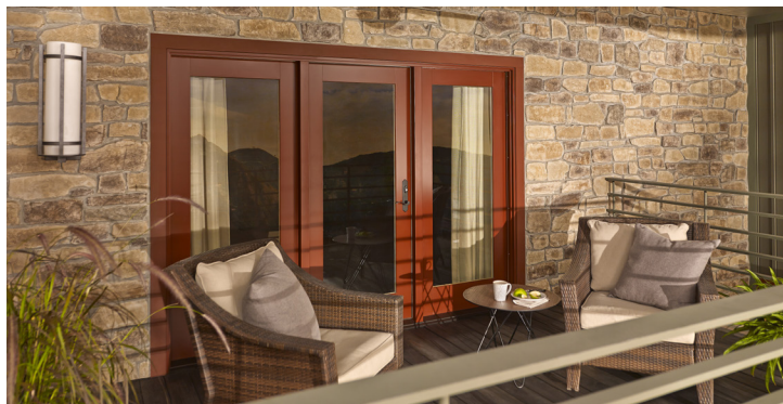
Manorstone in Oswego