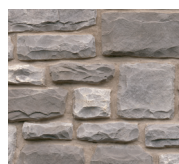
PA Lime 8046