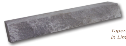
Tapered Sill in Lime