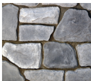
PA Lime 8046