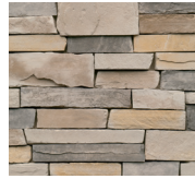
Alpine Mist 8080