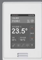
Dark grey touch screen