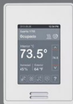
Grey touch screen