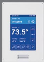
Blue touch screen

Selectable colour scheme and language options