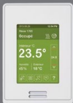
Green touch screen