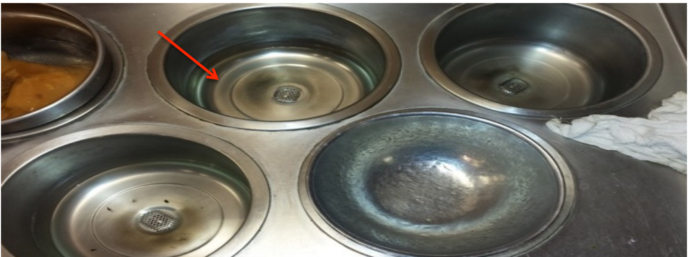
09/17/14 - White calcium powder can now be wiped off with a finger