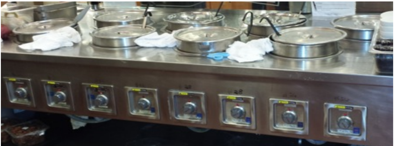
9/11/14 – The manager chemically cleaned basin of 3 Hot Wells