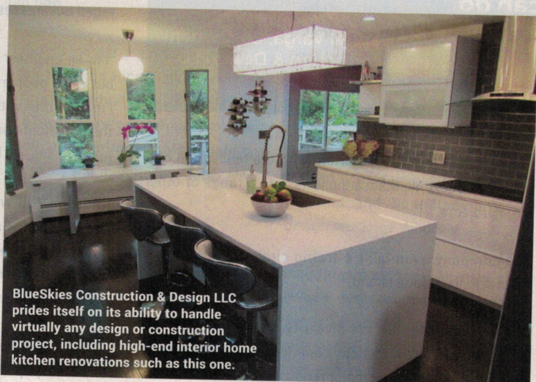
BlueSkies Construction & Design LLC prides itself on its ability to handle virtually any design or construction project, including high-end interior home kitchen renovations such as this one.