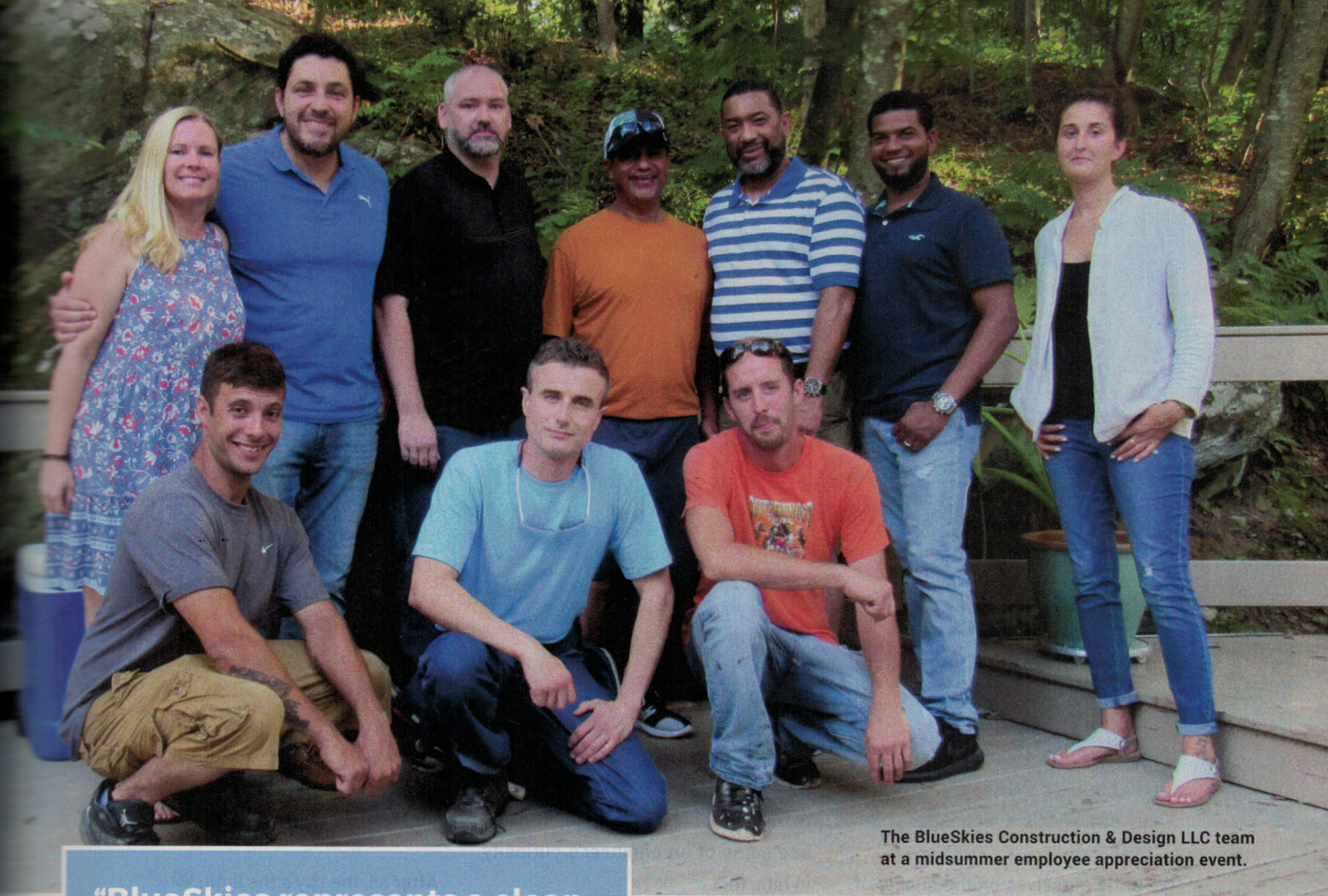
The BlueSkies Construction & Design LLC team at a midsummer employee appreciation event.

“BlueSkies represents a clean environment. But it also symbolizes that we don’t see any limitations to what we can design and create, where we can go or what we can do.”