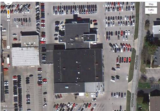
1. Satellite Image

Many parking lots are over lit or too bright in some areas and too dark in others. Using the process below, we can optimize your parking lot lighting with increased uniformity while reducing your overall system wattage. This can typically be done with one-to-one fixture replacement, or even with a reduction of fixtures for even greater savings.