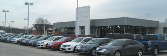
2. Field Audit