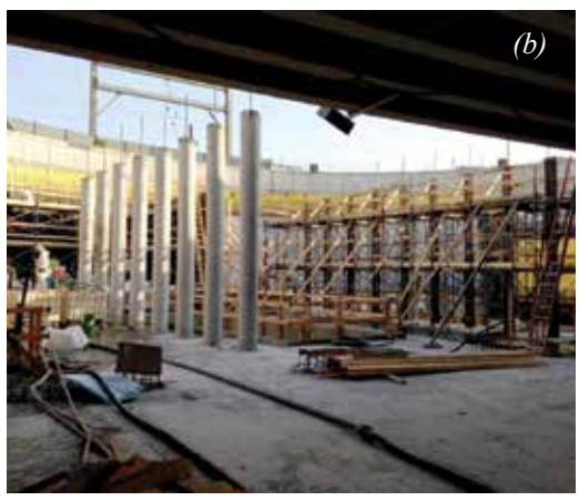
Fig. 2: Round columns. Most had: (a) a roof to wire and support; and (b) some did not