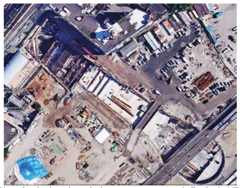
Fig. 1: CQ32 is a four-level ventilation facility, passenger station, and office for the MTA. Five other active projects are adjacent to and/or tie directly into the project, making logistics a challenge

Superior Gunite installed concrete on structural perimeter walls, interior I-beam walls, interior steel-reinforced walls, and circular and