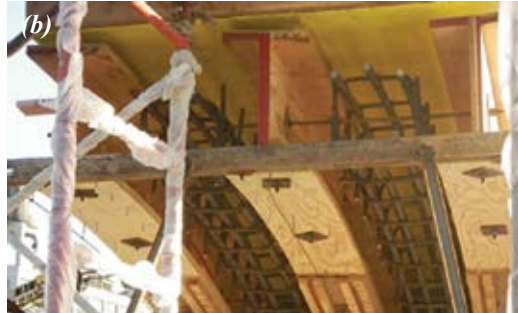
Fig. 5: Mockup of ring girder shoot