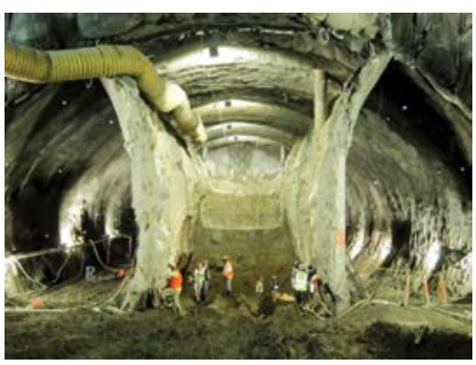
Fig. 2: CQ39 Excavation

above the tunnel alignment, extending to bedrock for complete groundwater cutoff. The freezing of the ground costs the New York Metropolitan Transportation Authority (MTA) $11,000 per day. Every day the liner completion could be accelerated, the more savings to the MTA. A value-engineered approach was given to the MTA to shotcrete this liner in lieu of traditional cast-in-place. This offered both savings in time and construction cost. Without the shotcrete alternative approach, an elaborate, costly, and time-consuming tunnel form system would have to be engineered, delivered, and assembled in the tunnel for traditional formed cast-in-place concrete. The contractor estimates that close to 2 months were saved using the shotcrete alternative.