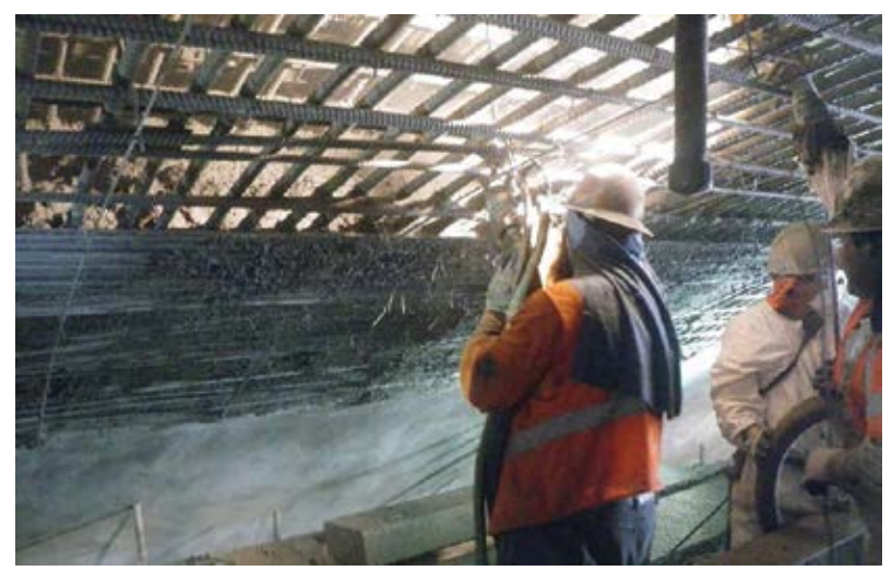
Fig. 7: Nozzle in outer layer of reinforcement, encasing the back layer

application, the coordinated teamwork from Schiavone/Kiewit JV and Superior Gunite's team made this a huge success. The freezing operation was turned off early and the load from the six-lane thoroughfare on top, with an overhead train line running 500 trains per day, continued. This was the first part of a much bigger project to bring the Long Island Railroad into a new terminal beneath Grand Central Station in Manhattan (refer to Fig. 9(a) and (b)).