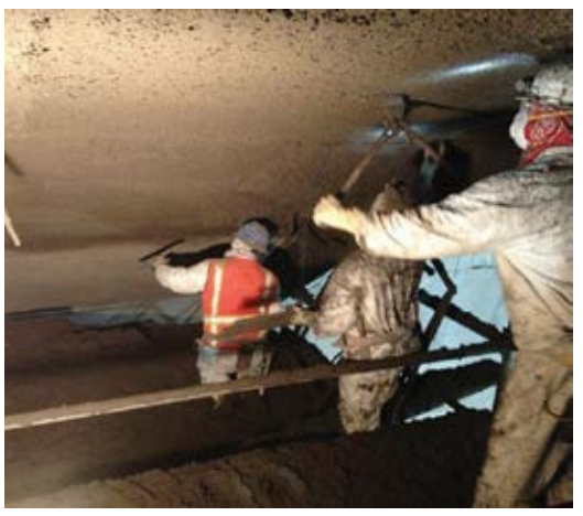
Fig. 8: Cutting of guides and finishing