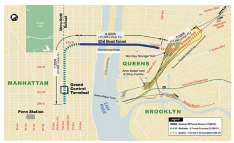
Fig. 1: East Side Access overall project scope

Contaminated plumes in the area also dictated the installation of a protective frozen arch