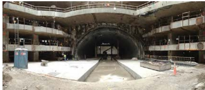
Fig. 9: Finished tunnel looking east to west under Northern Boulevard