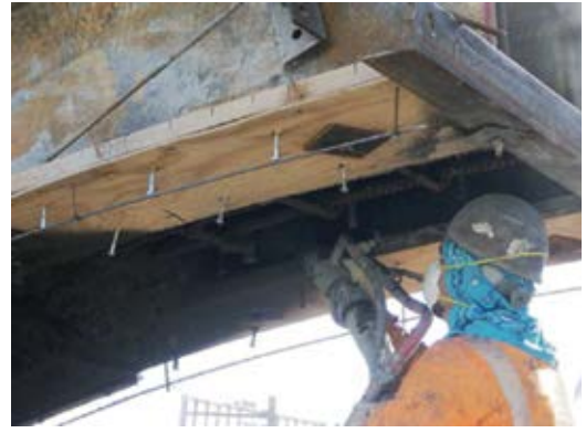
Fig. 6: Shooting the mockup

the conversion was accomplished with minimal down time.