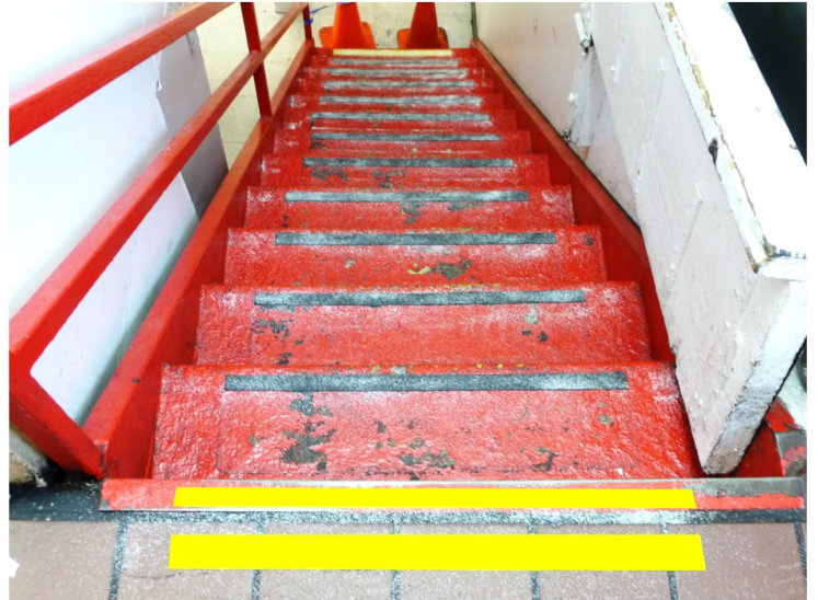
McDonald's Restaurant Steps to Basement Storage Anaheim, California