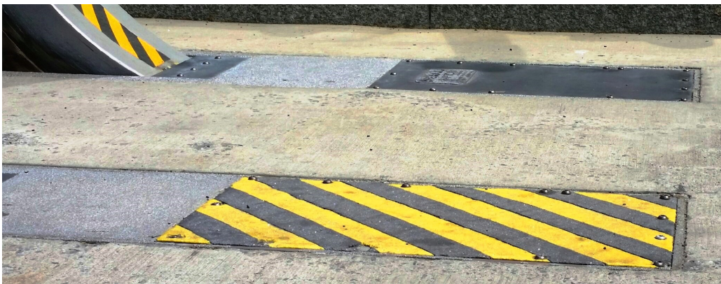
World Trade Center, New York City Raptor Bollard Control Plate Cover Liberty Place Security Access Point