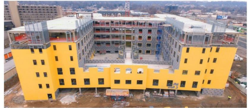
DIF New York Construction LLC examined bid documents, contracts, change orders and schedules for The Bristol at Englewood, a 273-unit assisted living development by The Engel Burman Group.

Under a complex management plan, MTA Capital Construction had to purchase expensive equipment years before it was to be installed. DIF New York helped with a plan for extending warranties and maintenance of the equipment.