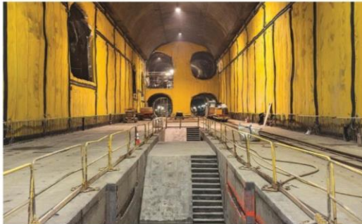
In 2016, DIF New York Construction LLC reviewed the asset management plan of the Metropolitan Transportation Authority's East Side Access megaproject.

In another case, the submitted bid specified for air conditioning ducts to be installed inside beams, which is not possible. "The bid drawings should have called for the ducts to be installed below the beams. The way it was written, the ceiling would have to be lowered to accommodate the ductwork. Because we found this problem on time during our review, we saved time and money instead of finding this crucial problem during the work on-site," Feder says.