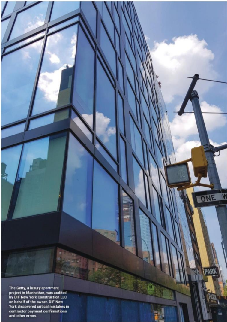
The Getty, a luxury apartment project in Manhattan, was audited by DIF New York Construction LLC on behalf of the owner. DIF New York discovered critical mistakes in contractor payment confirmations and other errors.