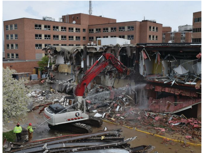
Renascent clears a hospital site in Indianapolis.

In addition to complete removal of towers and major university dormitories, airport structures and other projects, Renascent recently completed a 400,000-sq-ft partial demolition of an active hospital in Indianapolis, which included a five-story separation from the hospital’s main structure. Renascent designed and implemented a comprehensive deconstruction plan for the project, and it even reused all of the concrete from the demolition as backfill on the site.