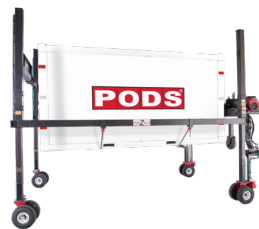
PODZILLA® Our Patented Lift System

Our patented lift system keeps even full containers level while being loaded onto and off PODS trucks. PODZILLA also allows drivers to easily position containers in hard-to-reach or tough-to-fit spots.