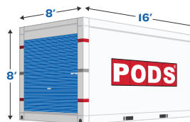
16' Container Cubic Feet: 857

Our Containers conveniently rest at ground level, so you can load and unload with ease.