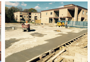
Parking Garage and Ramp Repairs