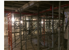
Parking Garage Repairs