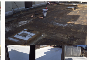
Roof Terrace Repairs