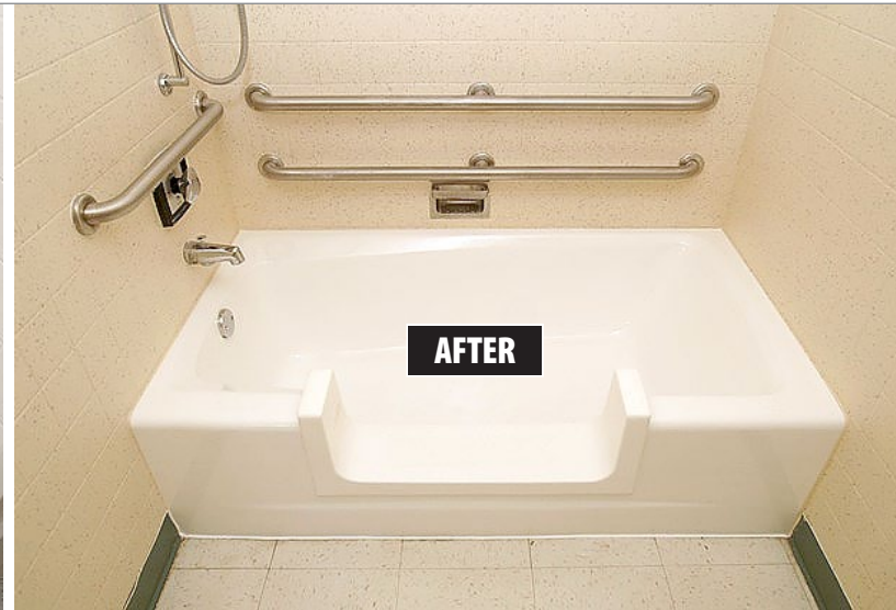
▲ Miracle Method installed Easy Step® bathtub-to-shower conversions, and sealed the tile wall grout permanently from mold & germs.