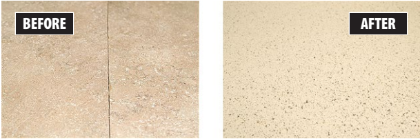
▲ Seams in the laminate where repaired.