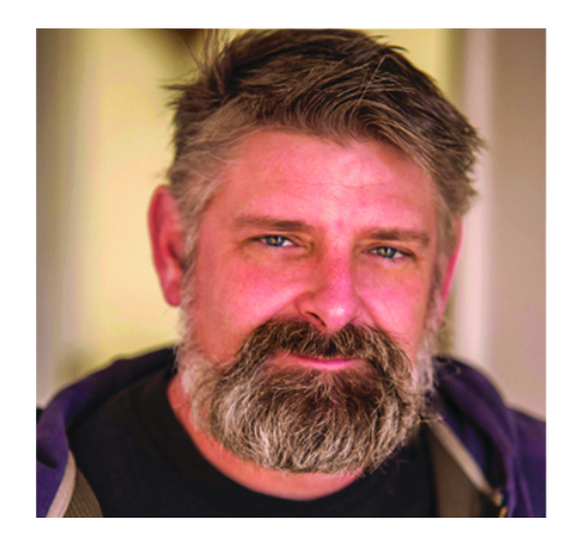
Your Forever Plumber Among the tag lines for American Service Specialists include: "The Best in the Business" and...