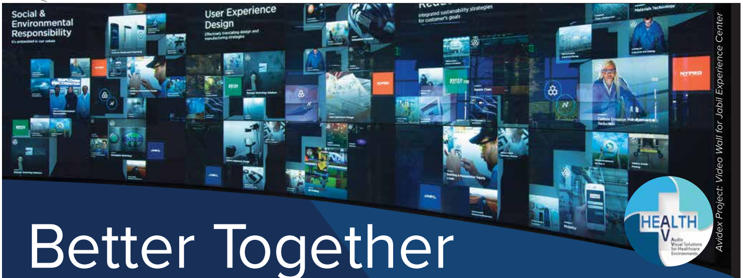
Avidex Project: Video Wall for Jabril Experience Center