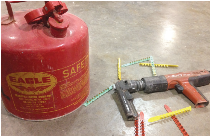
Never discharge a powder actuated nail gun near an explosive source. Always store unspent rounds in the gang box.

Take advantage of this opportunity to learn how to use these helpful but powerful tools properly.