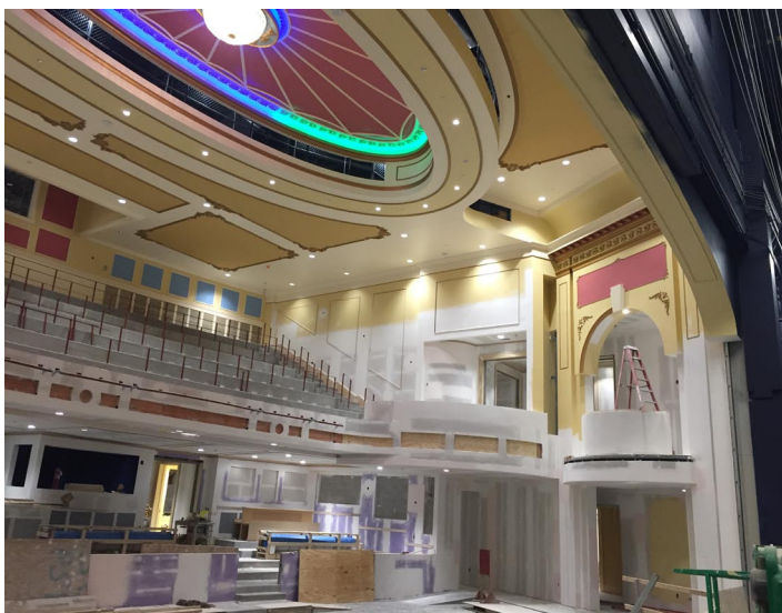
The theater at Providence Academy in Plymouth is a thing of beauty. The school was one of many projects completed in a banner year for RTL Construction.

Former Vikings quarterback Brett Favre predicts that his former rival, the Green Bay Packers, will represent the NFC in the Super Bowl. "They will be in the Super Bowl," Favre said.