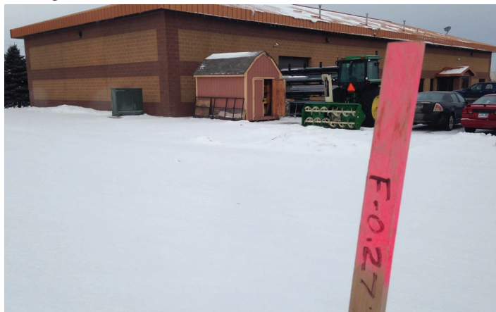
An expansion of RTL Construction's headquarters is in the works. Additional shop and office space are part of the renovation.

RTL's January work force has grown to levels normally seen during the summer months. RTL estimators are working to ensure the momentum continues well into 2016 and beyond. A shop expansion is in the works, details of which are sketchy at press time, but there are stakes sticking out of the snow.